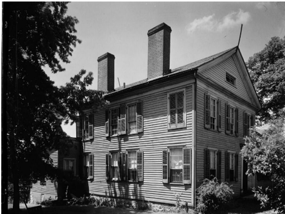
Frizel-Welling House, Jackson, Cape Girardeau County, MO, ca. 1933.