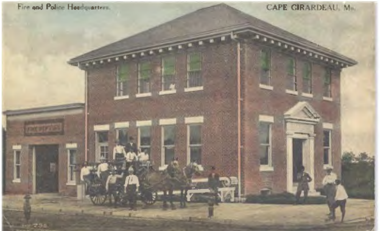
Old Fire Station No. 1 in Cape Girardeau – Once doubled as both Police and Fire Headquarters.